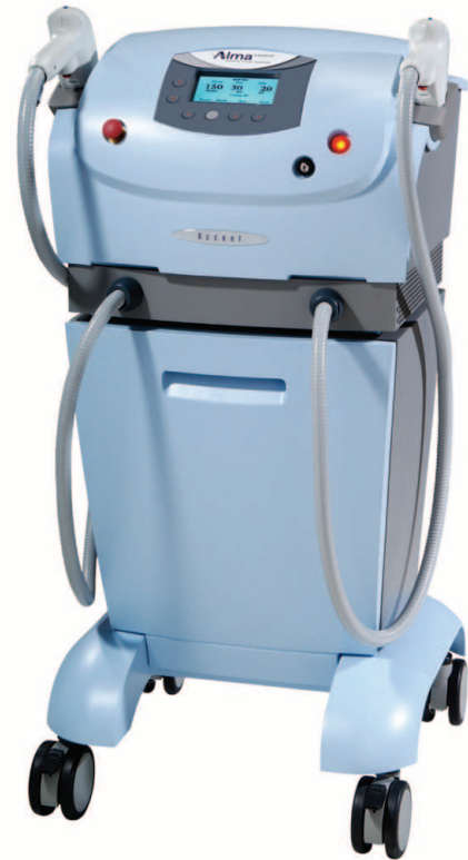
ABOVE: THE ACCENT RF MACHINE

The immediate effect of this heat is to cause the dermal collagen to contract, giving a skin tightening effect. The skin glows and is erythematous for 1–2 hours. There is also a slower progressive effect, where the heat stimulates more collagen production, giving a plumper, more rejuvenated appearance of the skin.